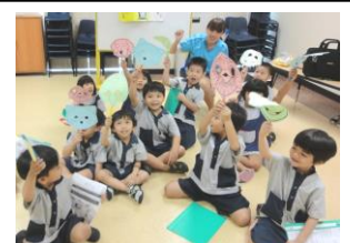
We have fun!