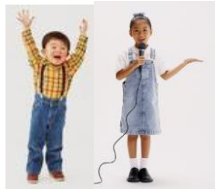
I can speak!