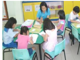
I can write!