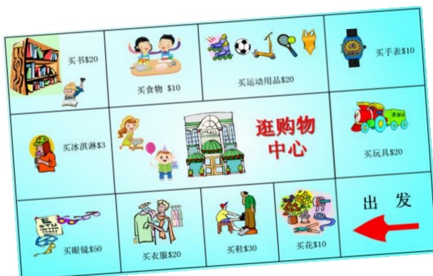
Conversation in a shopping mall (The "Monopoly" Game Approach)

Speaking Games played in class further encourage children's interest in speaking Chinese.