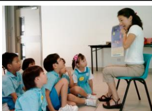
Engrossed in stories